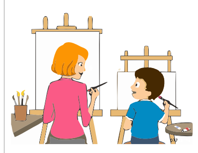
Visual / Spatial navigator sculptor architect