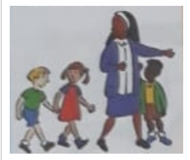
Verbal / Linguistic Journalist teacher lawyer