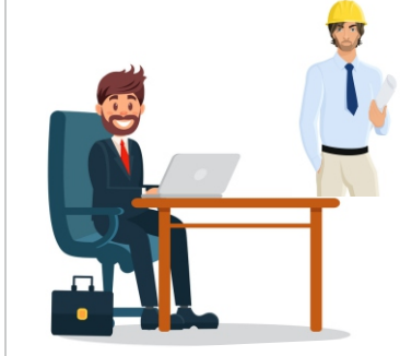
Logical / Mathematical engineer programmer accountants

Bodily / Kinesthetic athlete firefighter actor