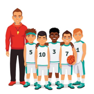
Sports Guidance / Idea